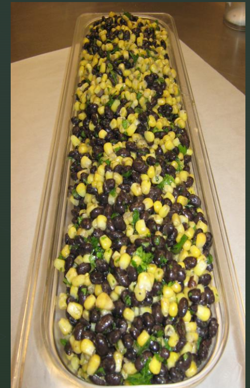
Black Bean + Corn Salad