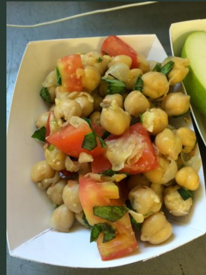
Garbanzo + Tomato Salad