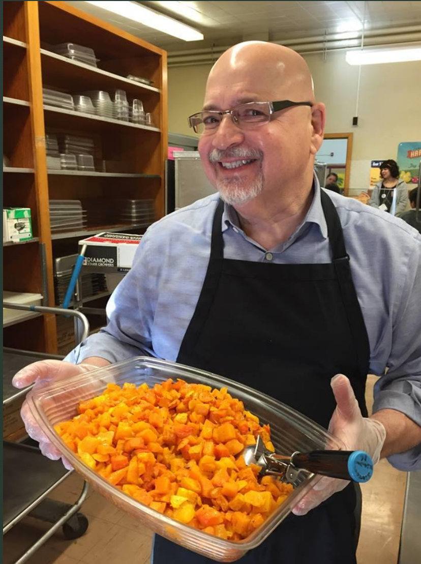
Slow Food Volunteer Sampling Roasted Butternut Squash

Growing Gardens + NS Staff sampling Kale Salad