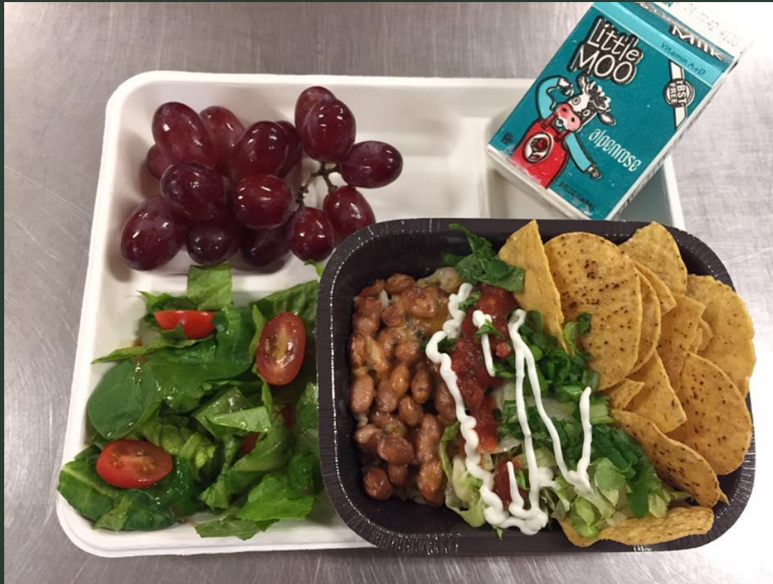
Southwestern Bean and Rice Bowl