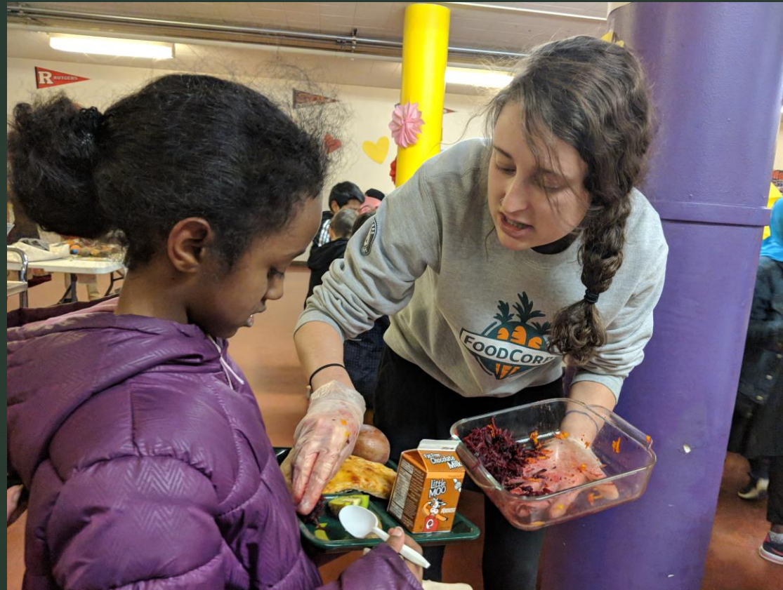
FoodCorps Sampling Harvest of the Month Beets