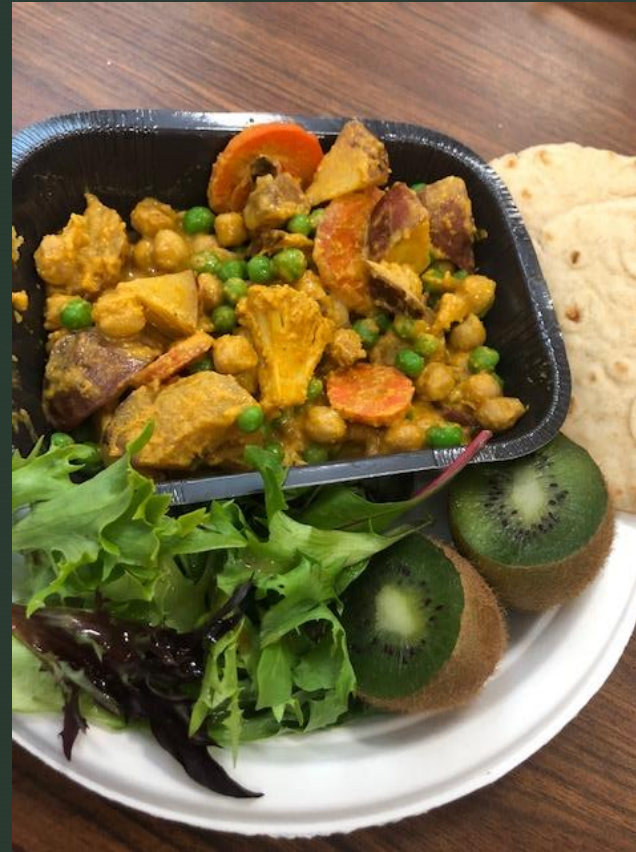
Chickpea and Vegetable Indian-style Curry in January