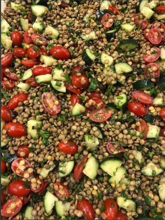
Lentil Salad in February